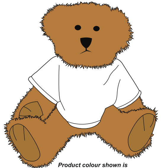
Product colour shown is a representation only.

Product: 15cm Bear with T-Shirt T-Shirt Colour: Print Colour: Print Position: Quantity: