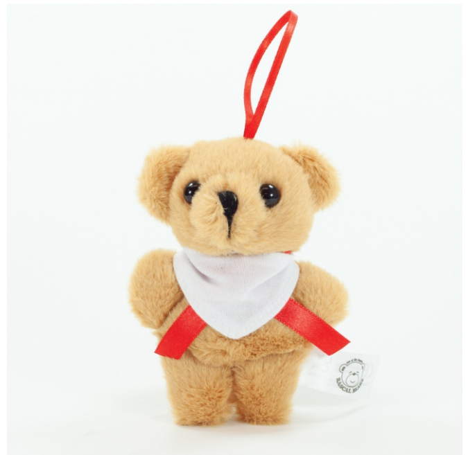
The image shown is for illustration purposes only, is not to scale and may not be an exact representation of the product ordered.

Print Colour: Print Position: Front Quantity: