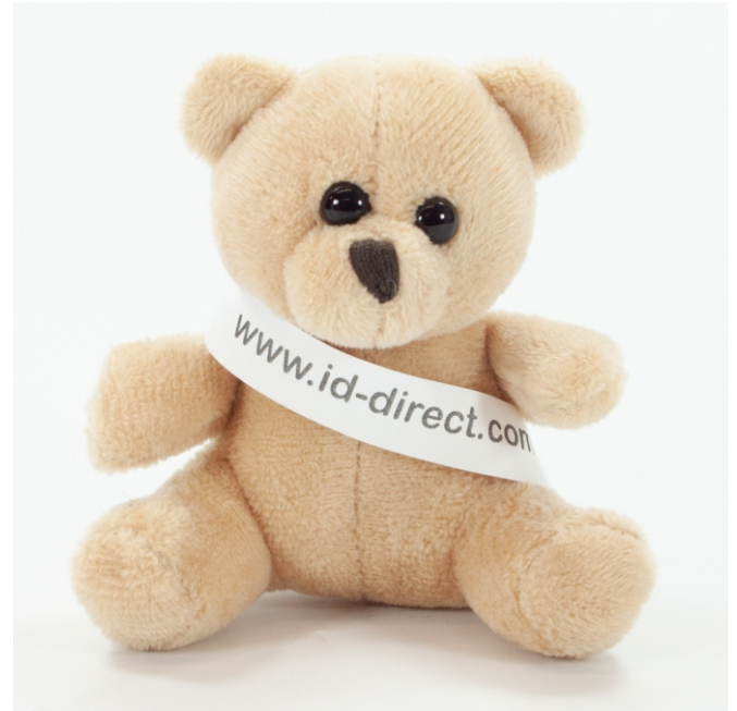
The image shown is for illustration purposes only, is not to scale and may not be an exact representation of the product ordered.

Lime Green Line = Print Area, this will not be printed.